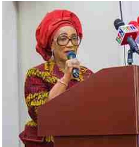
Amb. Dr. Kema Chikwe